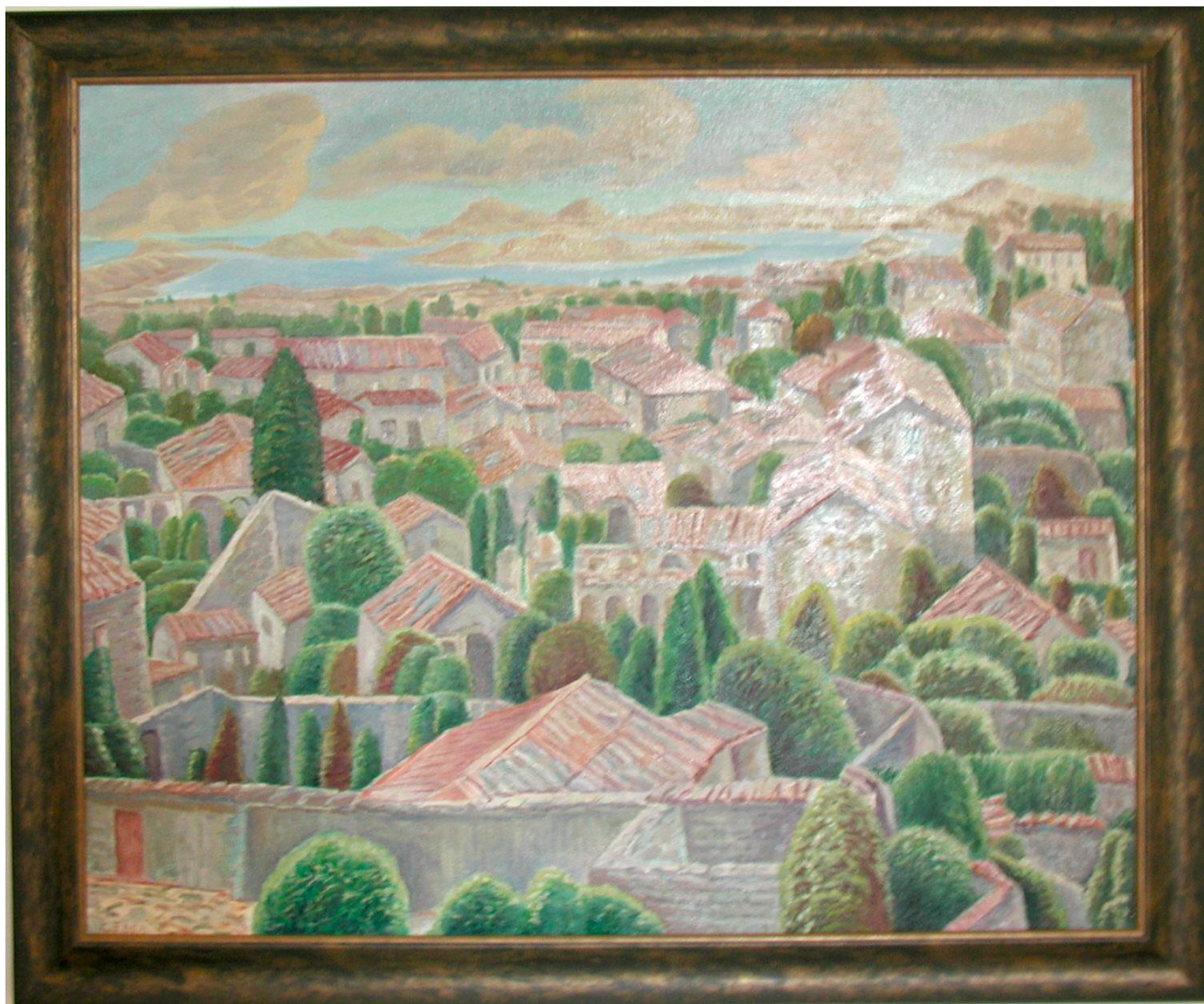
"Aeropolis II" by Charles Furr oil on canvas