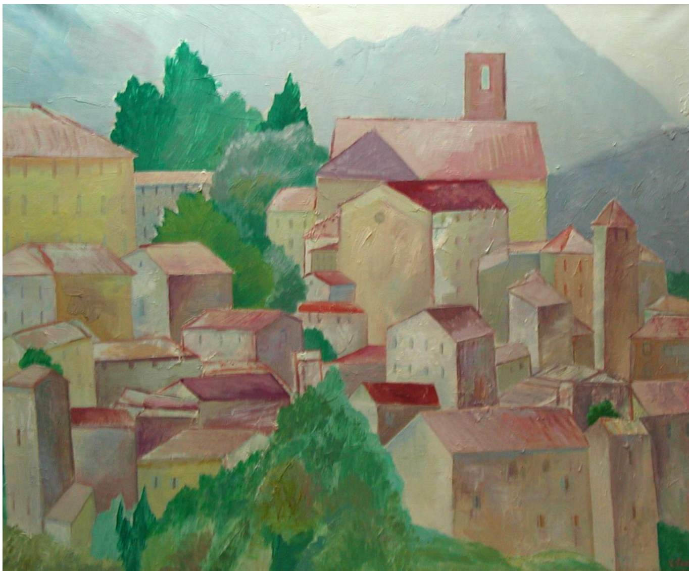
"Montefalco" by Charles Furr oil on canvas 57 x 43