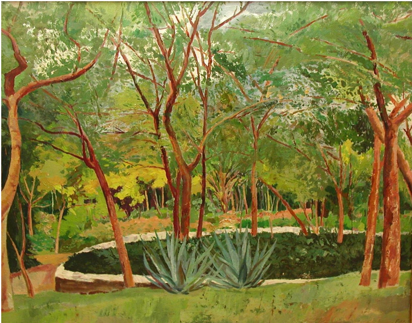
"Kew Garden" by Charles Furr oil on canvas 42 x 34