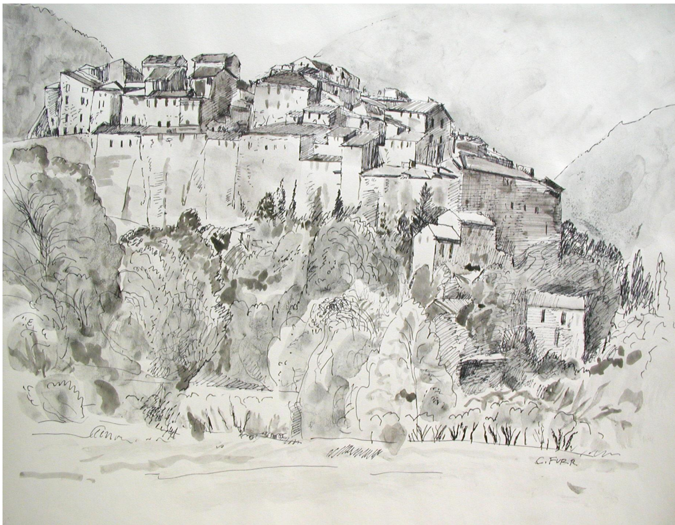
"Castle Felice" by Charles Furr ink drawing 35 x 21 framed