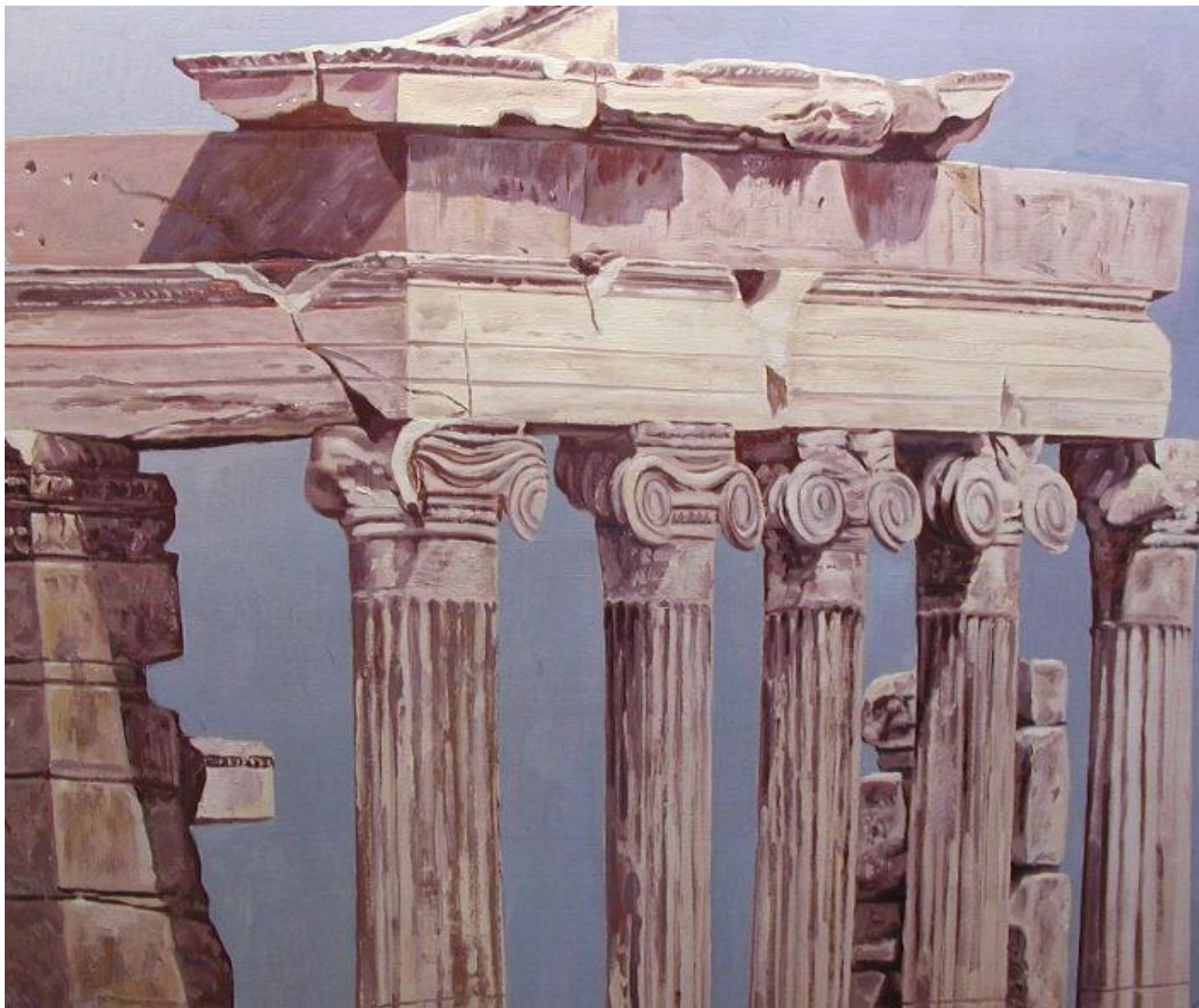
"Greek Ruins" by Charles Furr oil on canvas 44 x 52