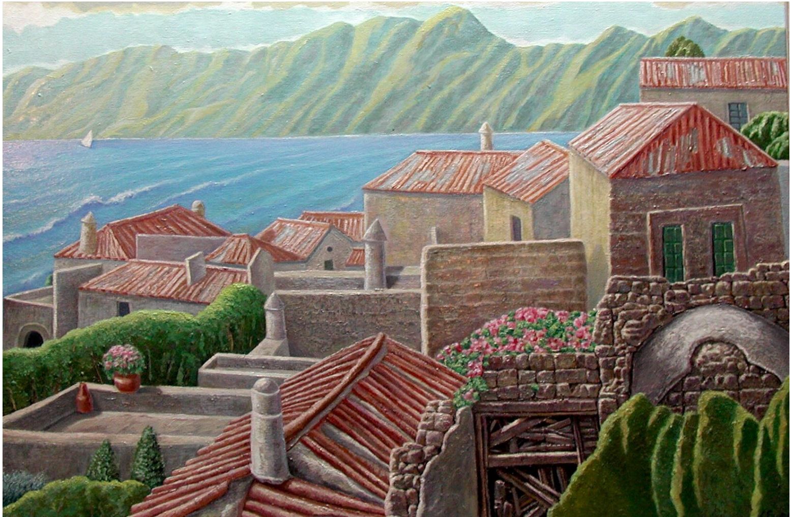
"Monemvasia Seashore" by Charles Furr oil on canvas 51 x 35