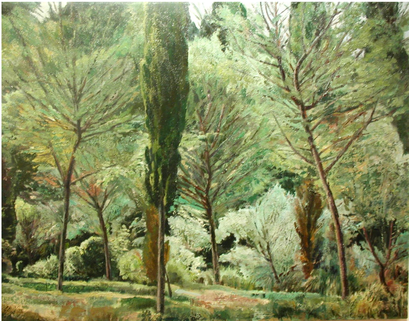
"Fiesole Garden" by Charles Furr oil on canvas 37 x 47