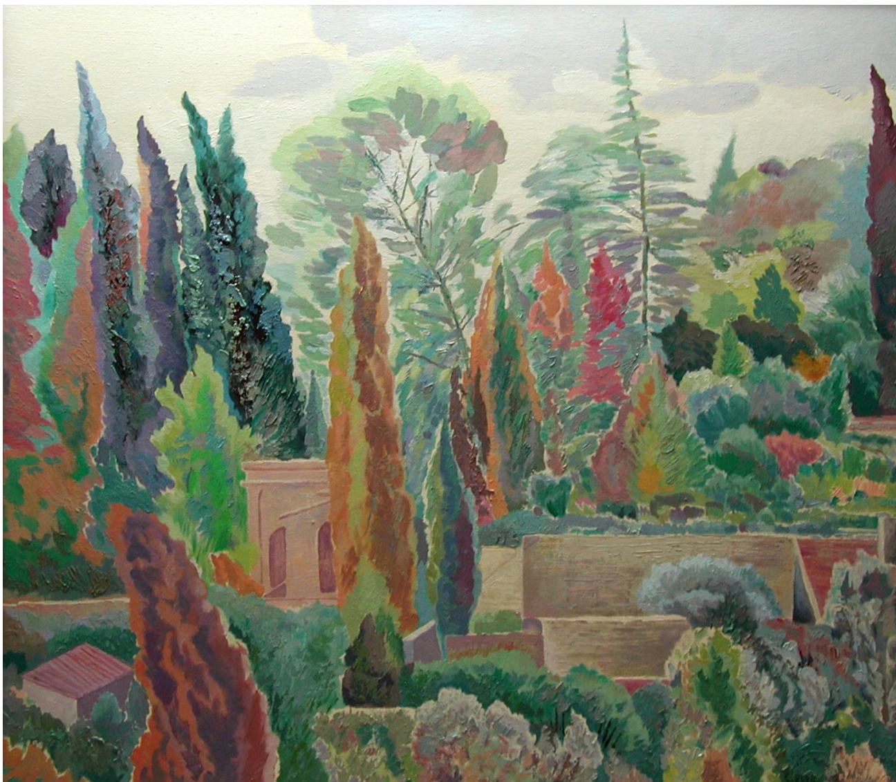
"Villa Schifanoia" by Charles Furr oil on canvas 50 x 44