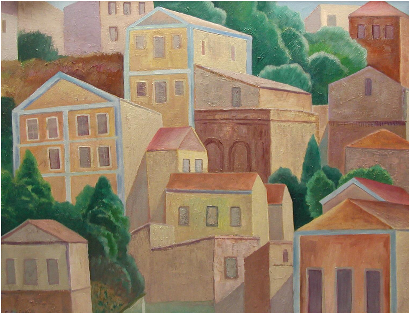
"Hills of Symi" by Charles Furr oil on canvas