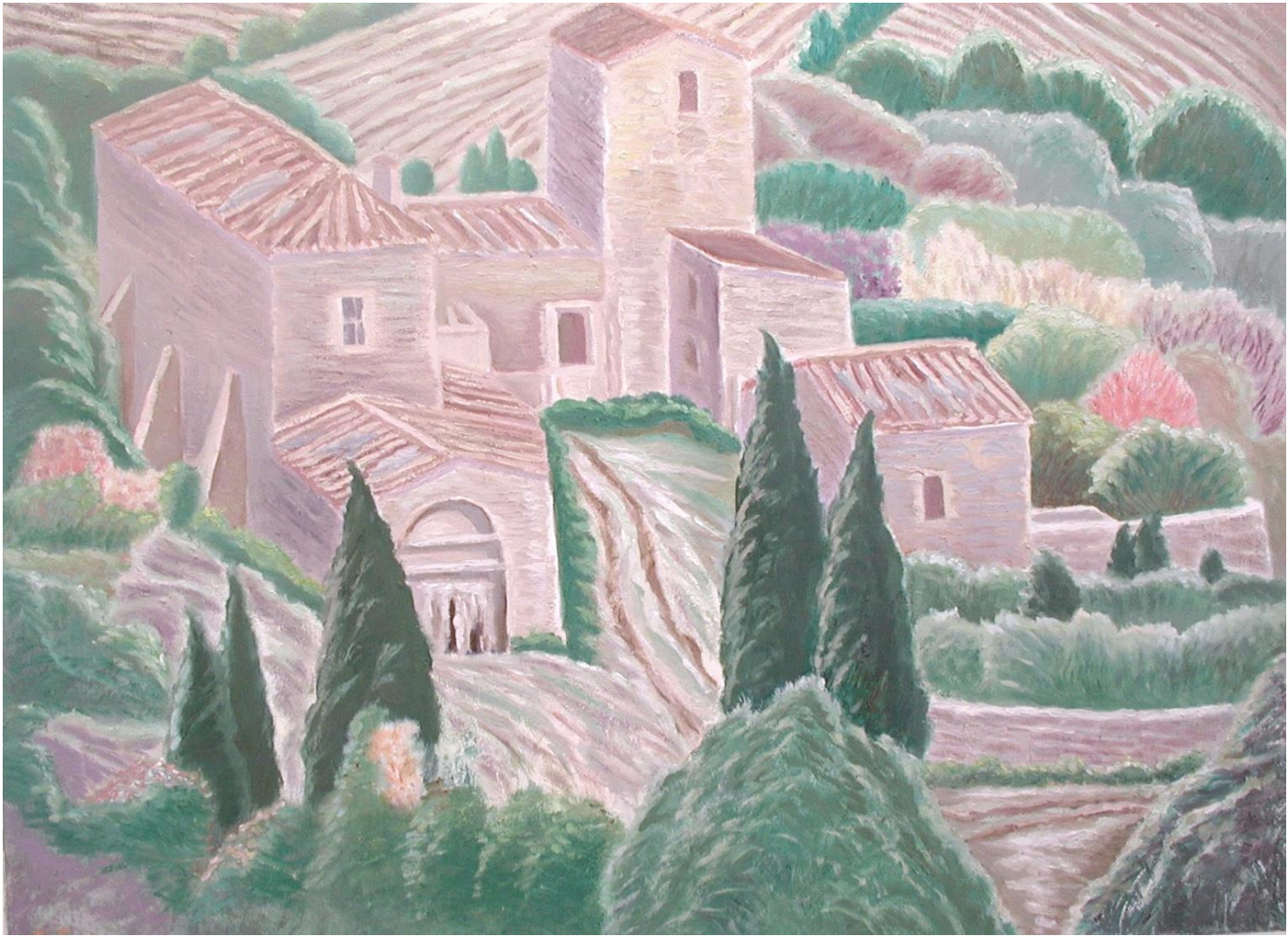
"Casa Colonica" by Charles Furr