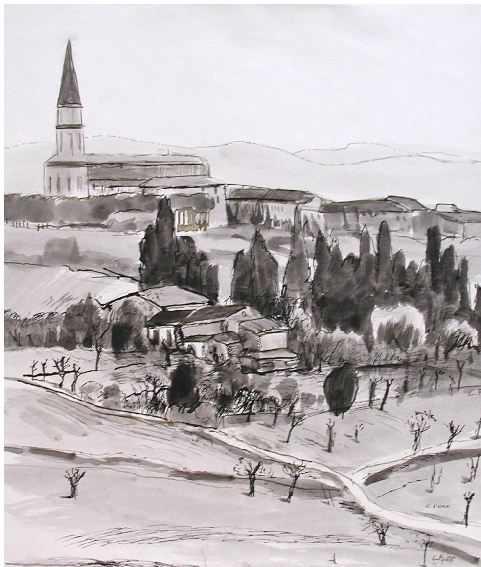
"Cerrezzo" by Charles Furr ink drawing