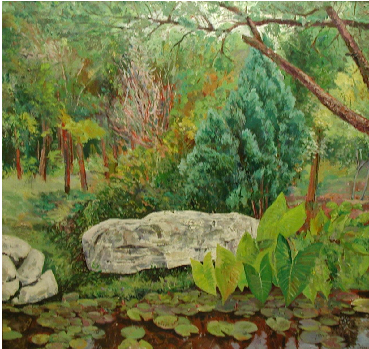
"Kew Garden-Stone Reflection" by Charles Furr oil on canvas 44 x 46