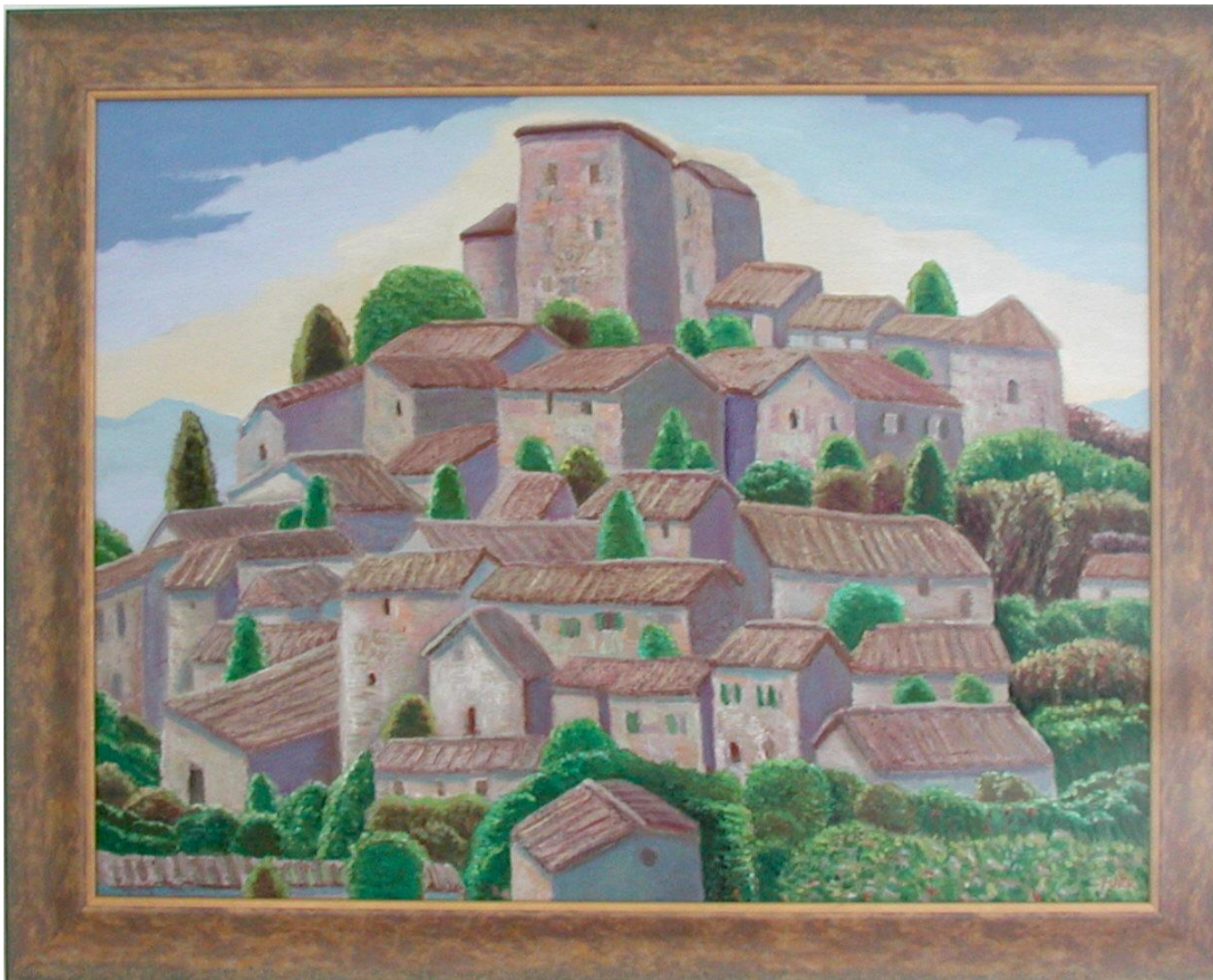
"Morning Hill Town" by Charles Furr oil on canvas