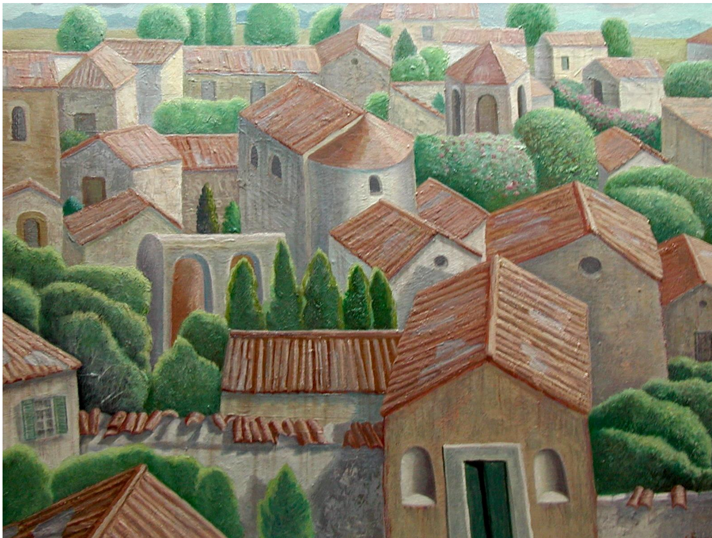
"Monemvasia" by Charles Furr oil on canvas 44 x 34