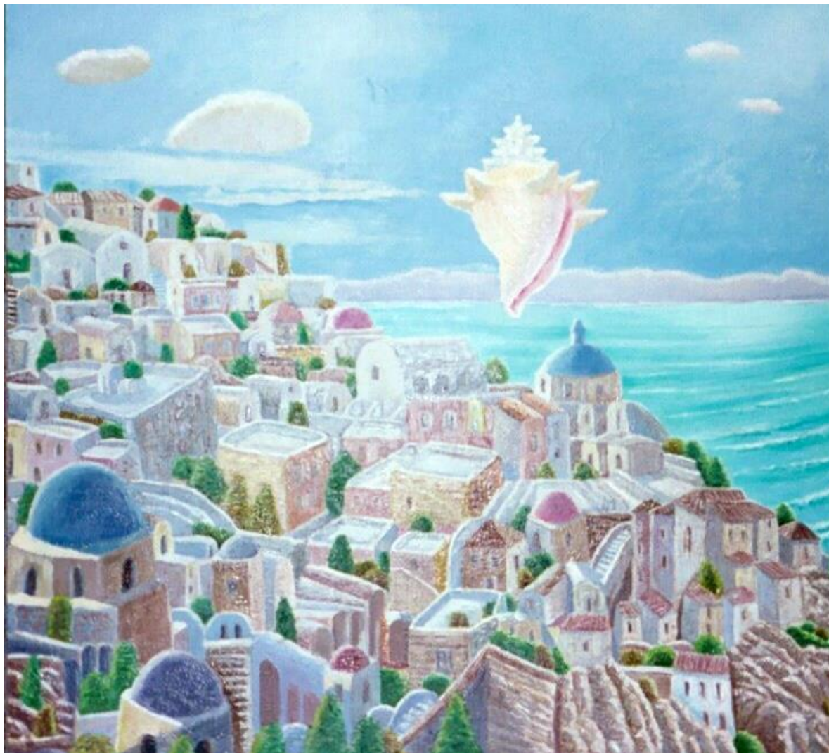
"Suspension in Santorini" by Charles Furr oil on canvas 44 x 48