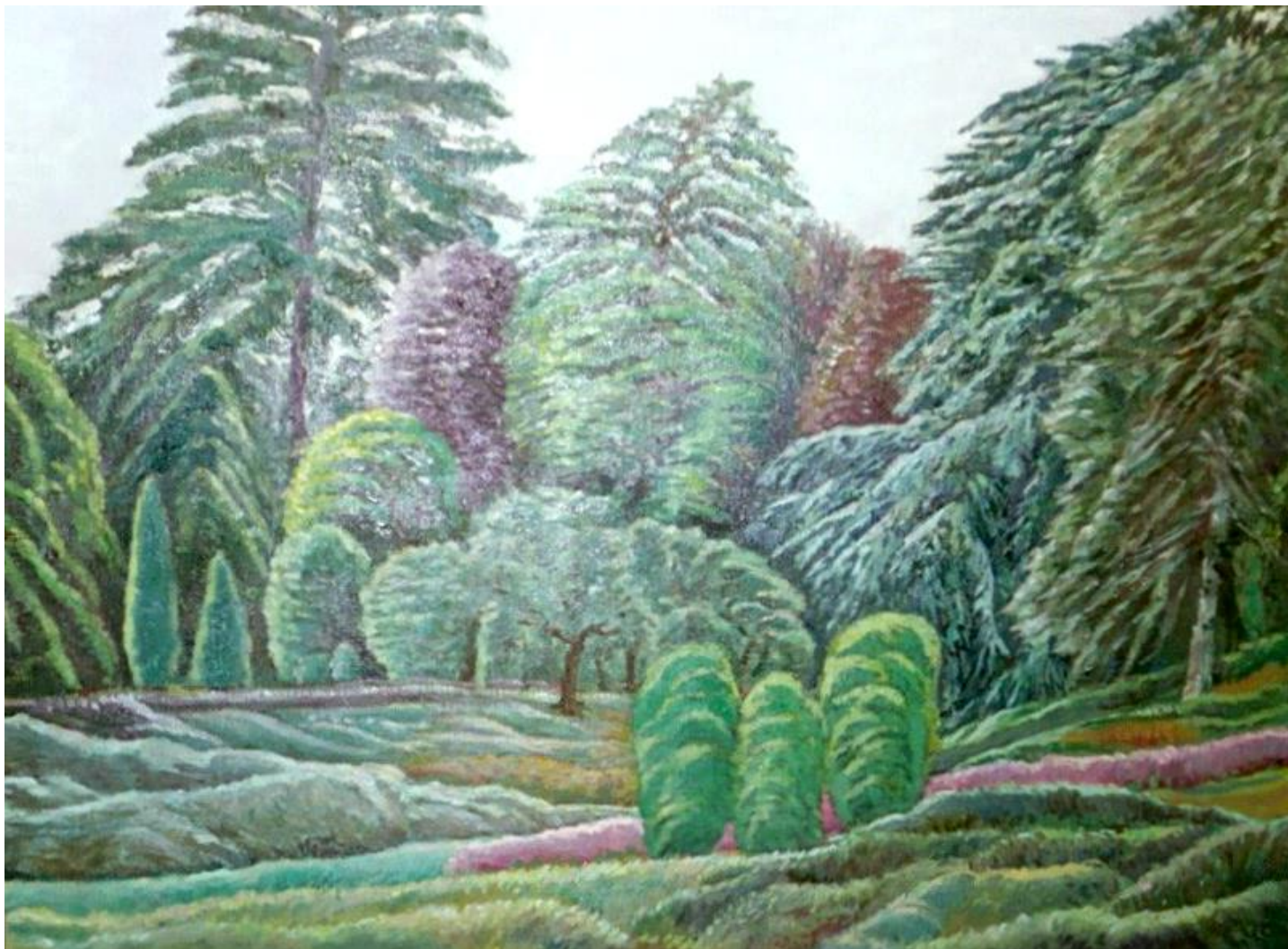
"Fiesole Garden II" by Charles Furr oil on canvas